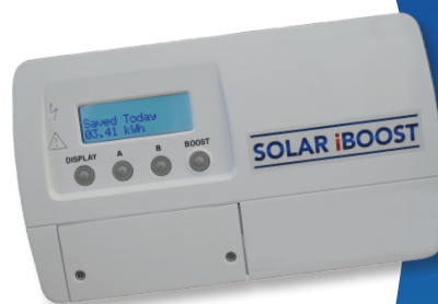
Dims: 260 x 130 x 64mm Wt: 505g